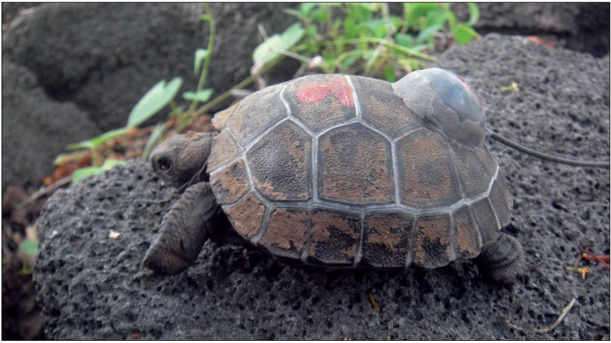
Fig. 1. The tortoise nicknamed 'Moz' with a VHF transmitter affixed to its shell.