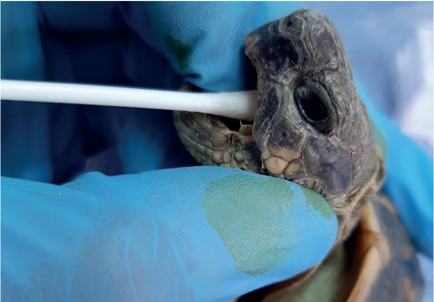
Fig. 2. Taking an oral swab in an adult wild (free-living) tortoise.