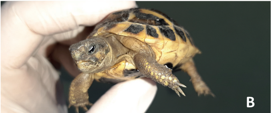
Fig. 5. (A) An obviously soft and deformable carapace and plastron of a hatchling Testudo hermanni affected by tortoise Picornavirus and (B) a healthy, alert and round hatchling of the same species.