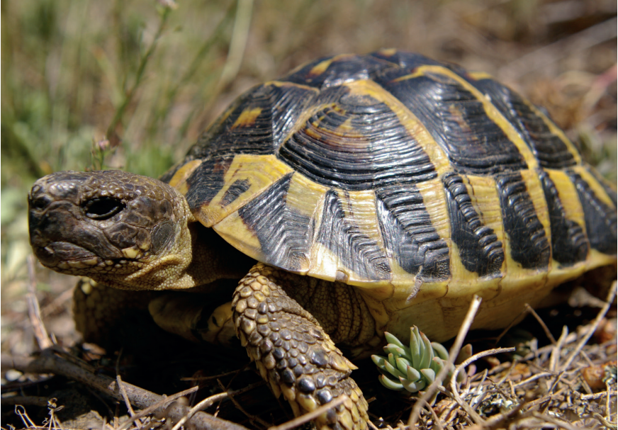
Fig. 1. A healthy western Hermann's tortoise ( Testudo hermanni hermanni ) in its natural habitat: Albera massif.

tortoises in the Serra de l'Albera. This population consists mainly of animals that have never lived in captivity, but in some areas of the Albera mountains, the population has been reinforced by captive-bred tortoises which had been hatched for this purpose in the breeding centre (Centre de Reproducció de Tortugues de l'Albera: CRT).