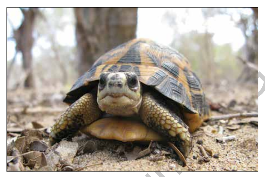
Fig. 1a. Madagascar spider tortoise Pyxis arachnoides arachnoides within its natural habitat in the forests of Tsimanampesotse National Park, south west Madagascar.