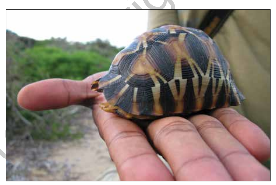
Fig. 1b. Shell of the radiated tortoise ( A. radiata ) Faux cap, south west Madagascar. This juvenile displays clear, intricate carapace patterning; such individuals sell for a premium price on the international pet trade.