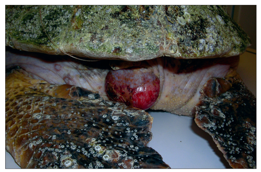
Fig. 11. Same animal as in Fig. 10 showing fishing line exiting through the cloaca. In this case, the fishing line affects the whole gastrointestinal tract and surgery is needed to remove it.

Fig. 10. This loggerhead turtle has ingested fishing line and part of it can be seen exiting through the mouth.