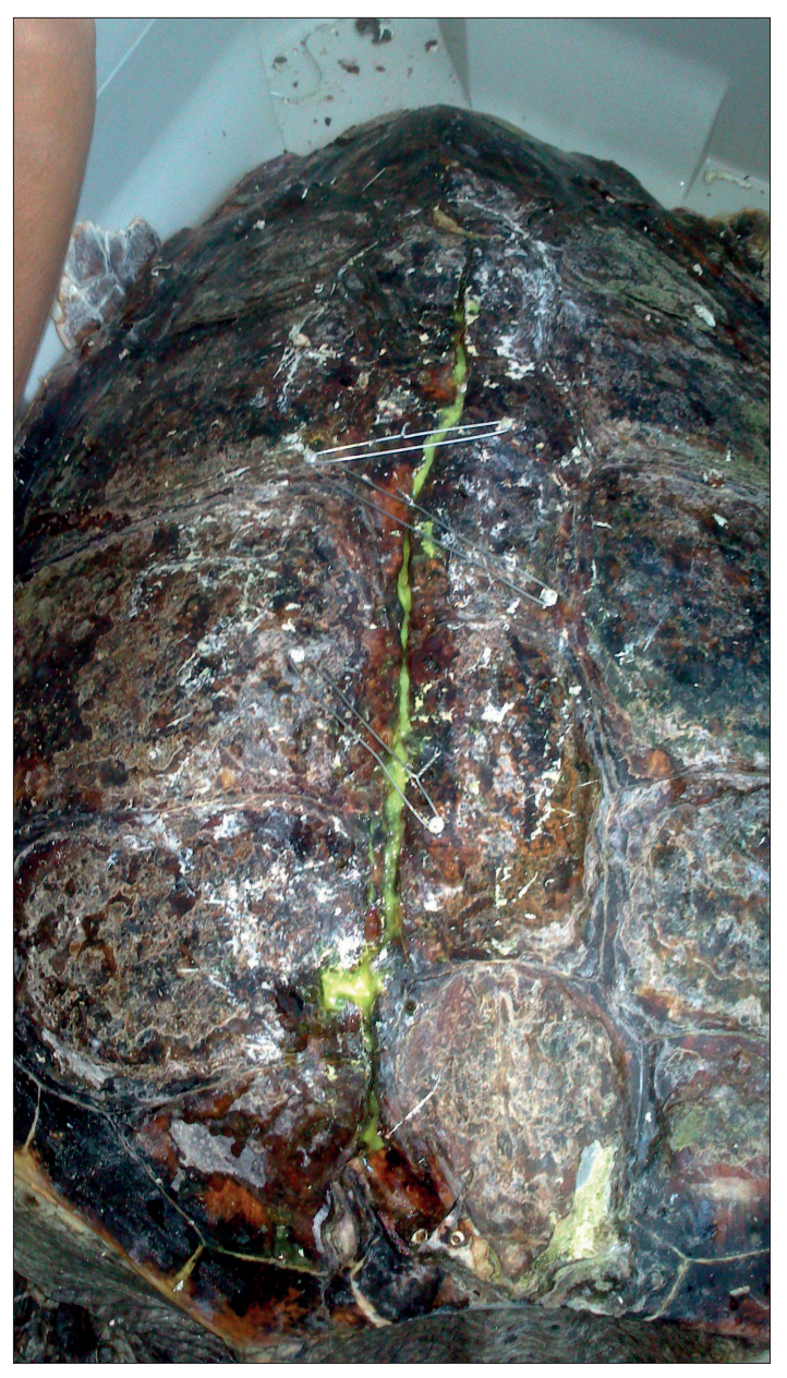
Fig. 7. Screws and wires used to stabilise a carapacial fracture in a loggerhead turtle.