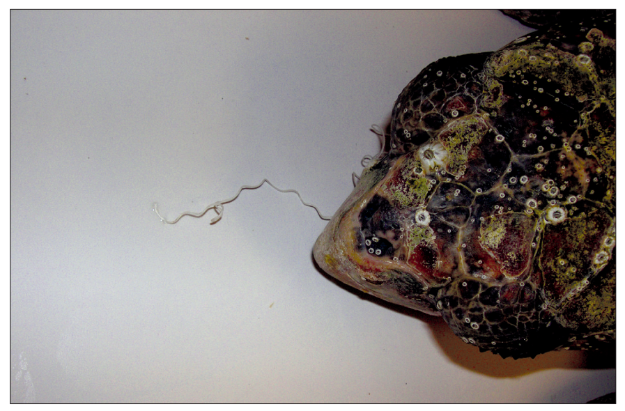
Fig. 10. This loggerhead turtle has ingested fishing line and part of it can be seen exiting through the mouth.