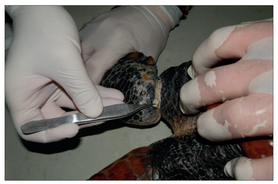
Fig. 13. Wound in the flipper of a loggerhead turtle caused by entanglement with fishing line.

Fig. 12. Fishing hooks can produce severe damage to the gastrointestinal tract of sea turtles. In the picture, a hook has perforated the lower mandibular area of a loggerhead turtle.