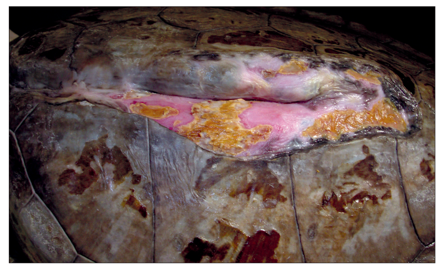
Fig. 5. Green turtle under rehabilitation due to carapacial fracture caused by propeller strike. These wounds may take months to heal. Similar to the animal in Fig. 4, sea turtles rarely present with fresh trauma.