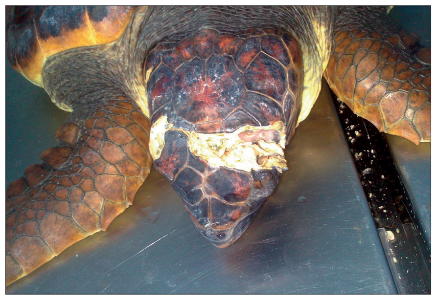
Fig. 4. Severe trauma with skull fracture and damage to the right eye in a loggerhead turtle. The brain was exposed and the wound characteristics were indicative of some chronicity. Although sea turtles have an amazing ability to heal, this animal was euthanased due to the low chances of returning it into the wild. As in Fig. 2, severe trauma to head or flippers carry a grave prognosis.

invasive method of treating wounds and carapacial fractures involves the use of the properties of salt water (Fig. 5). More intensive therapeutic options involve the use of antibiotic creams, honey and waterproof bandages. Some carapacial fractures can be stabilised with epoxy resin (water-resistant epoxy resin is easily available as it is commonly used to fix boats) (Fig. 6), while wire can be used to stabilise carapace, plastron or skull (Wyneken et al. 2006) (Fig. 7). Turtles with polytraumatized carapaces may need to stay out of water for several weeks, which produces no adverse effects if the principles of skin hydration are followed (Wyneken et al. 2006). These polytraumatized cases may need months of care and rehabilitation, with great cost and labour investments (Wyneken et al. 2006).