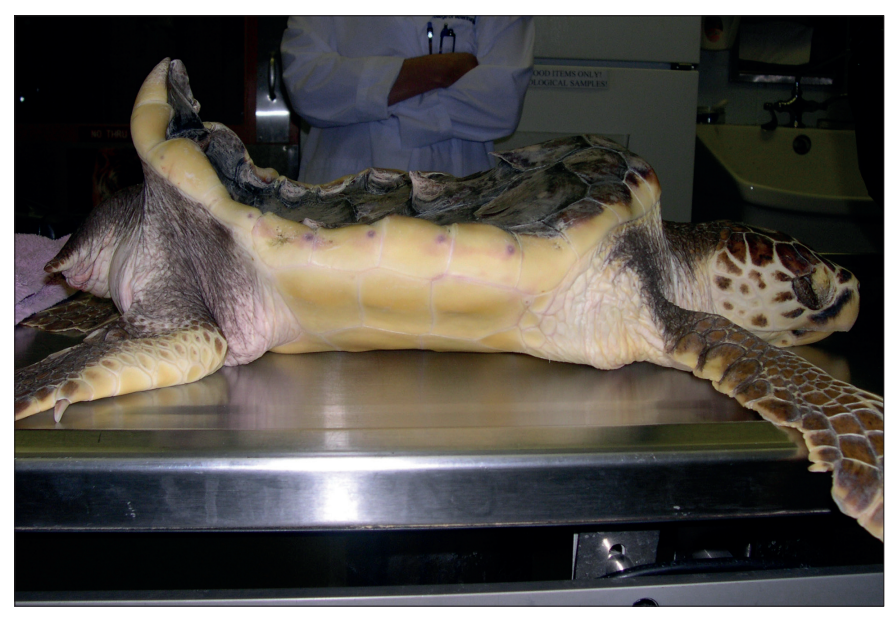
Fig. 3. A captive-reared two-year-old loggerhead turtle with increased size and deformed growth due to excessive feeding. Floating was so abnormal that the animal had to be euthanased.

ingestion of debris), oil spills, collection (of eggs and turtles) and interaction with fishing devices (bycatch) (Márquez 2004). This article reviews a selection of important causes of anthropogenic morbidity and mortality in wild sea turtles. When appropriate, veterinary treatment of these conditions is also explained.