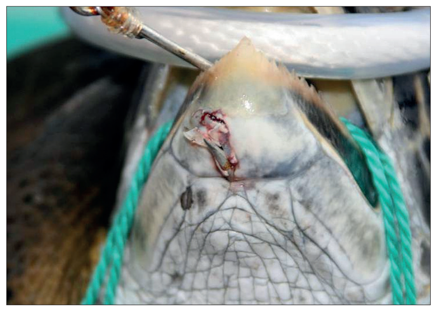
Fig. 12. Fishing hooks can produce severe damage to the gastrointestinal tract of sea turtles. In the picture, a hook has perforated the lower mandibular area of a loggerhead turtle.