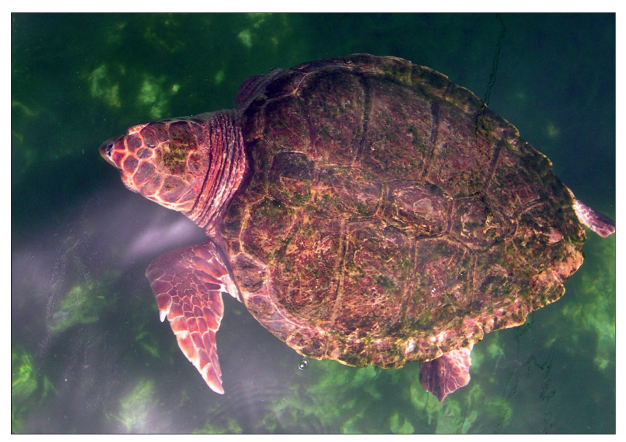
Fig. 2. Entanglement with fishing line has eventually produced the amputation of the right front flipper of this loggerhead turtle.