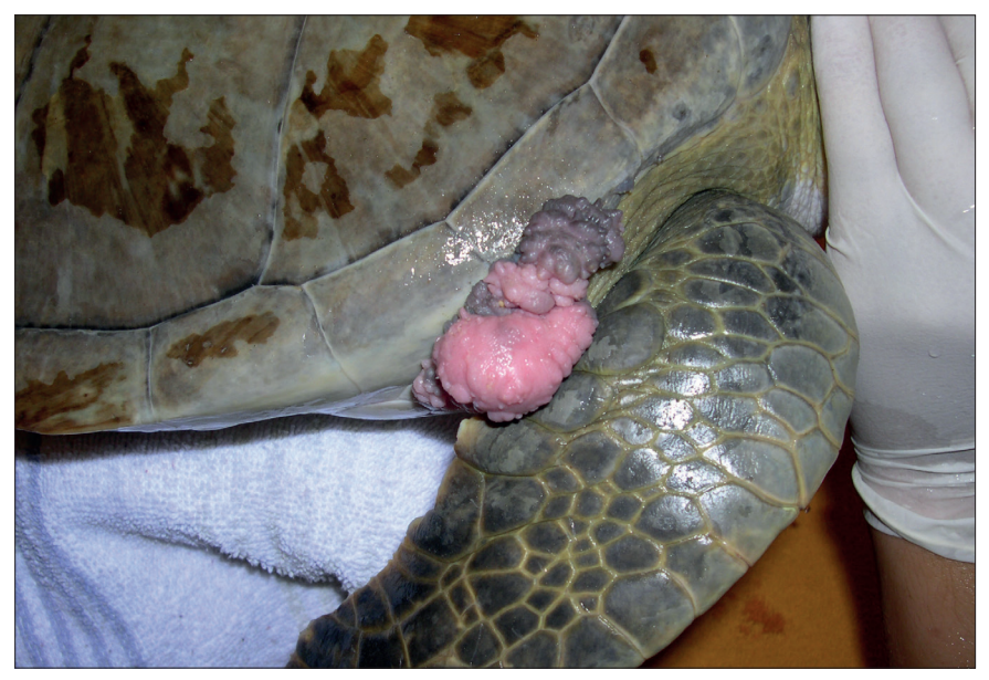
Fig. 1. Fibropapilloma in a green turtle. This condition affects mainly green turtles in Hawaii and the south-east of the USA.