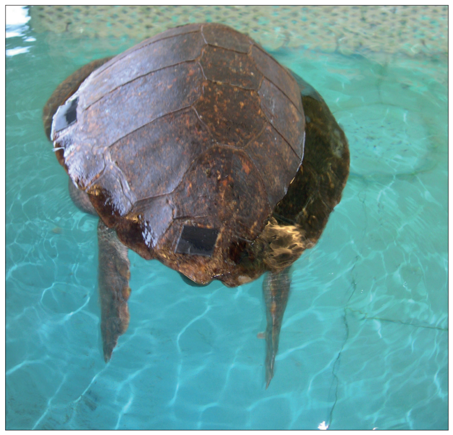
Fig. 8. Adult loggerhead turtle with a chronic buoyancy problem. If the problem is not resolved, these animals cannot be returned to the ocean.