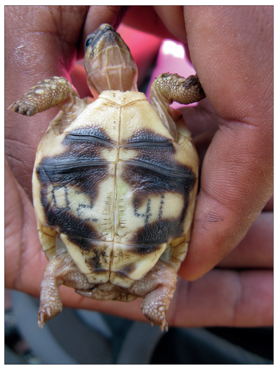
Fig. 5. Tattooed juvenile ploughshare tortoise.