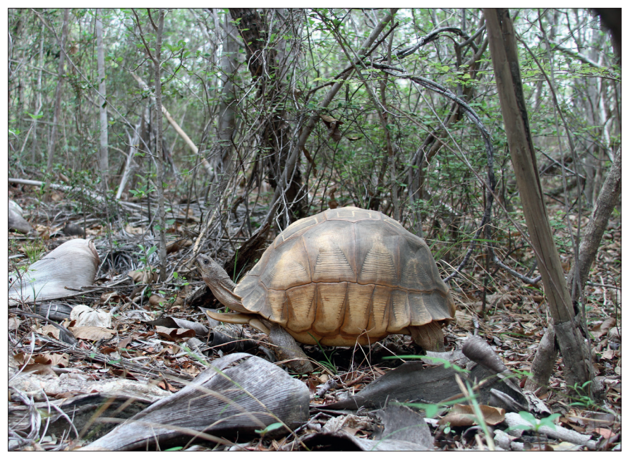
Fig. 1. A large male ploughshare tortoise in the Cap Sada region of Baly Bay National Park.