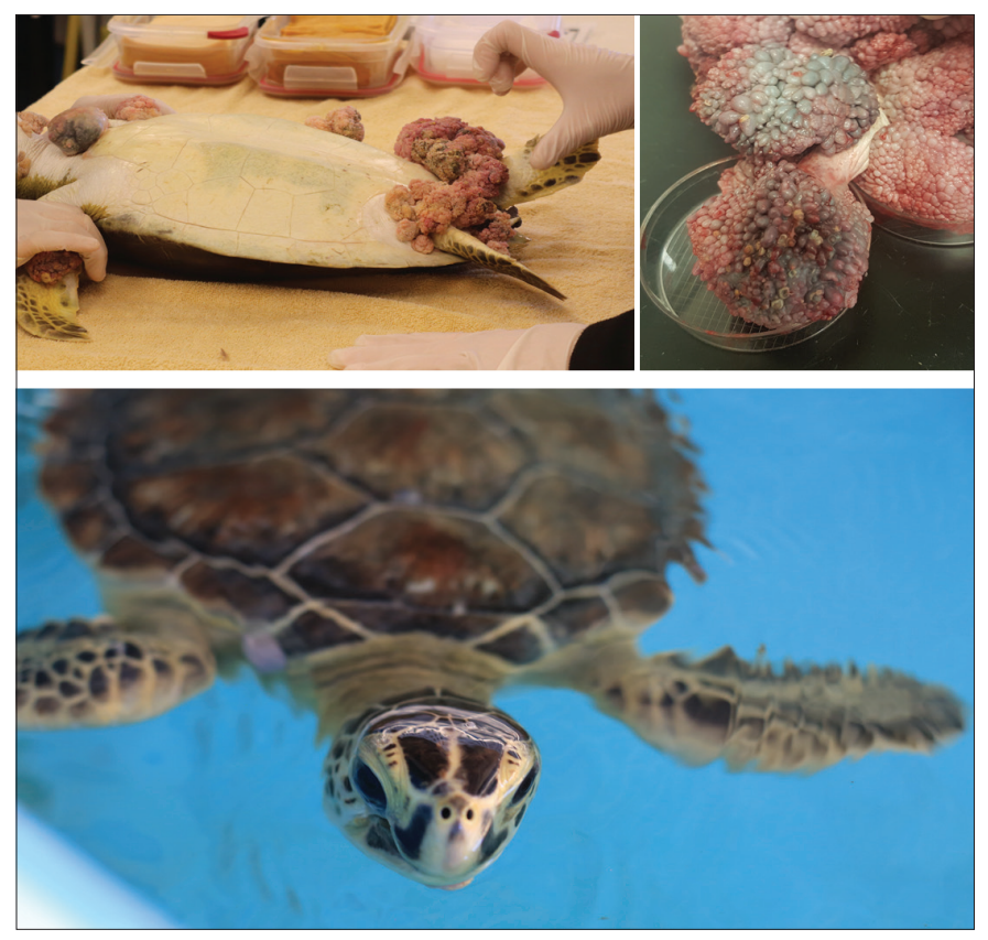
Fig. 1. Green turtles ( C. mydas ) at the UF Whitney Laboratory Sea Turtle Hospital, Florida, afflicted with fibropapillomatosis tumours. Top left: juvenile green turtle being evaluated prior to surgery. Top right: fibropapillomatosis tumour after surgical excision from patient. Bottom: green sea turtle in hospital rehabilitation tank.

bearing wild turtles (Brill et al. 1995), and found that tumour-bearing turtles surfaced less frequently at night than those without tumours, suggesting that FP tumours may impact turtle respiration. Compromised respiration therefore may affect their resting and foraging behaviour, negatively impacting their energy budgets (Brill et al. 1995). Some research has been carried out into the behaviour of healthy captive green turtles (Therrien et al. 2007), but to our knowledge the behaviour of turtles being treated for FP has not been documented. In other reptile species, minimally invasive procedures such as microchipping have been found to have a prolonged effect on stress levels (Langkilde & Shine 2006). Given that surgical tumour removal is more invasive than microchipping, it may be assumed that surgery would also have an effect on sea turtle stress levels. Although it is broadly accepted that FP